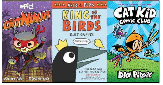
If your 2nd-grade child likes magic and mythical creatures, they'll love: