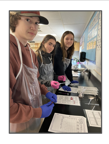
Biology 20 performed a blood typing simulation lab activity as part of their Human Body Systems unit.